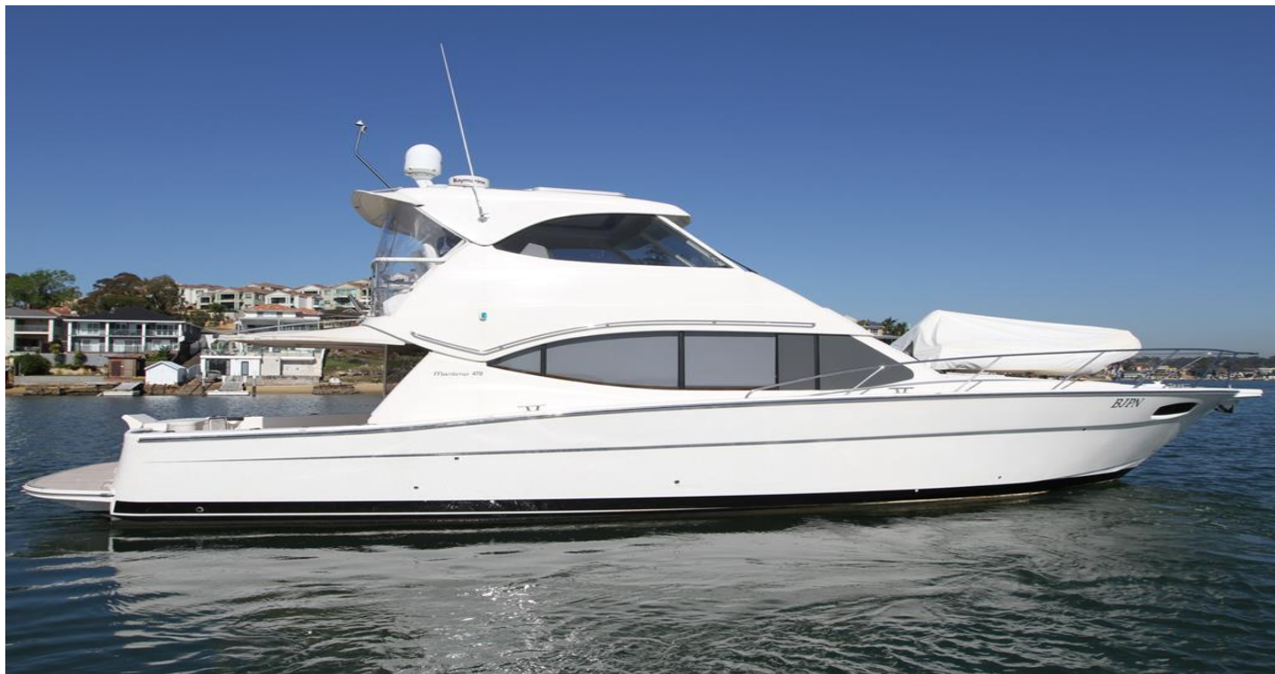
Maritimo 470 Offshore